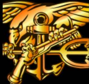
The Navy and the Sons of Neptune