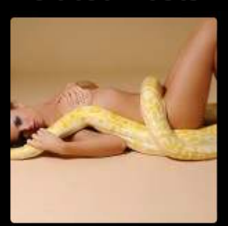
The Serpent Goddess