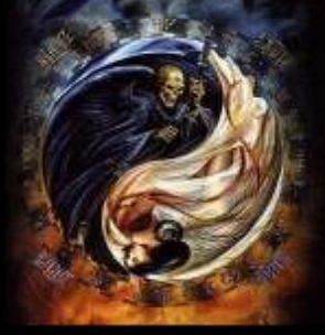
My name is Legion; because we are many