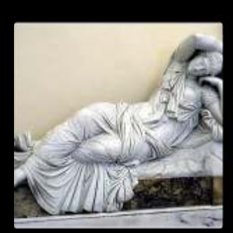
Sleeping Serpent Goddess in the Vatican