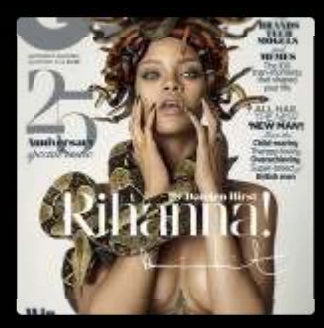
The Ancient Symbol of the Serpent is Really a Worm