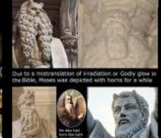
The History of Horned Gnostic Gods and Godmen in Images