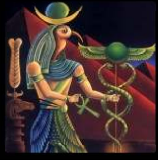
Alchemy is the Mystic Chemistry of the Soul