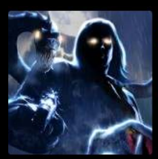
The Science of Demon Possession