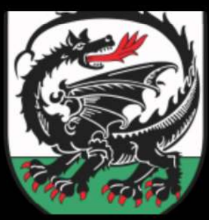
The Dragon Tribe of Old Prussia