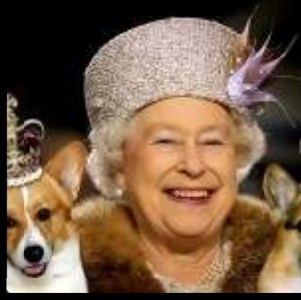
The Queen Archon's Mon-Archy